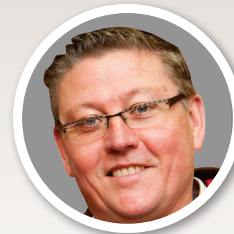
PROF RUSSELL KASCHULA

University of the Western Cape 13H00-14H30 22 September 2022 Omega